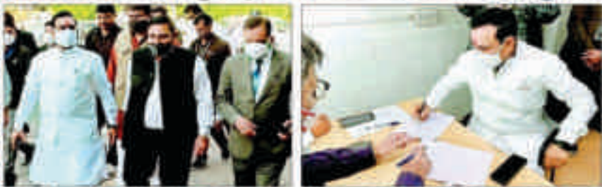
पीपुल्स मेडिकल कॉलेज में पहुंचे गृह मंत्री नरेंद्र मोदी। साथ में राज्य सरकार के मुख्य सचिव, राज्य सरकार के सचिव और डॉक्टरों की टीम भी शामिल थी। ट्रायल के ट्रयाल के लिए नरेंद्र मोदी ने साहजिकीय बनाया। हालांकि उनका फैसला डॉक्टरों के विरोध के कारण नहीं हो सका।